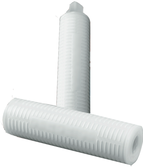
Figure 1: Flotrex GF Filters